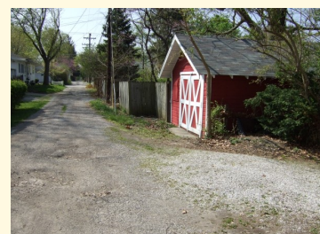
Photo: Alley in Broad Ripple